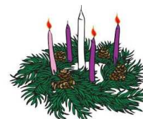
Third Sunday of Advent